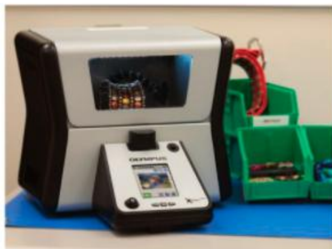
Integrated CMOS camera records sample images to memory.

samples. A simple tap on the touch screen in camera view activates the small spot 3 mm or standard spot 10 mm diameter collimation. An on-screen indicator shows the operator exactly where the analysis spot is focused.