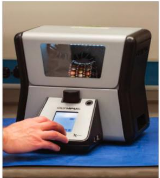
Close the chamber door and press Start to get results you can count on.