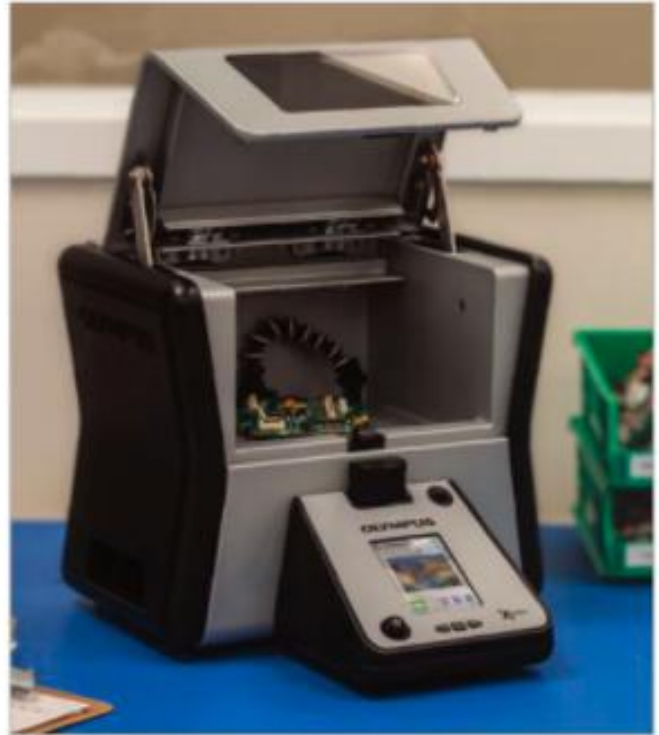
Secure small objects in the sample-holder to orient on the analysis window.