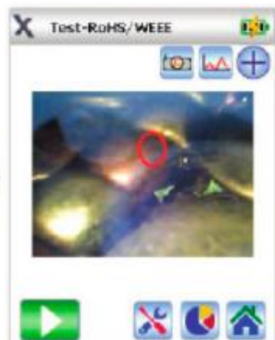
Detail of the 3 mm spot camera collimated