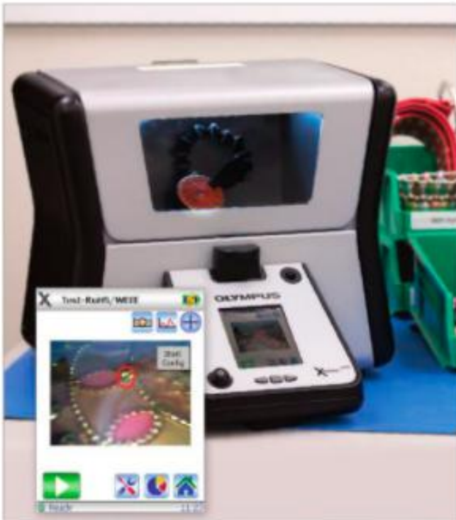
Use small spot collimation for very small objects or for small areas on an object.