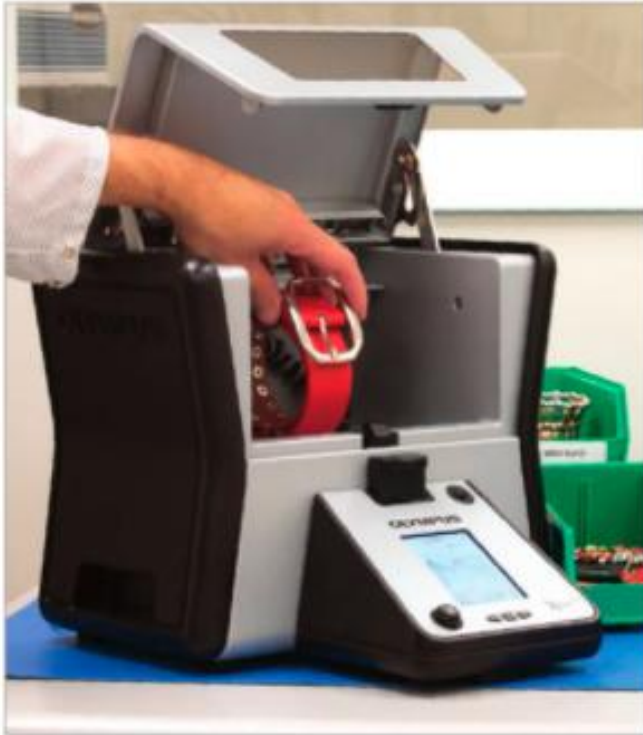
The Xpert is easy-to-use. Place large objects directly on the analysis window.