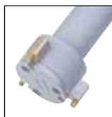
TiN-coated contact points (" -10" suffix models only)